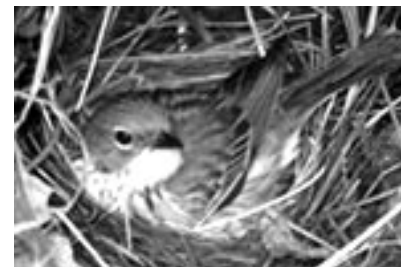
The Endangered Species Act has rescued the Kirtland's Warbler and other species, such as the recently delisted Brown Pelican, from the brink of extinction.

Responding to urging from thousands of Audubon activists and others, the Obama administration revoked a controversial last-minute rule change imposed by the Bush administration, which effectively gutted critical protections offered by the Endangered Species Act for threatened and endangered wildlife on the brink of extinction. Score one for the good guys and for species survival.