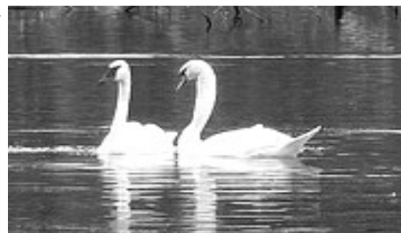
Trumpeter (L) & Mute Swan (R), Celery Bog Nov 11.

There are many items that don't fit this 8-page newsletter that we'll post there —such as interesting facts, other programs, etc.