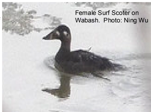
Female Surf Scoter on Wabash.

Track hummingbird migration at: www,humminbirds.net/map.html